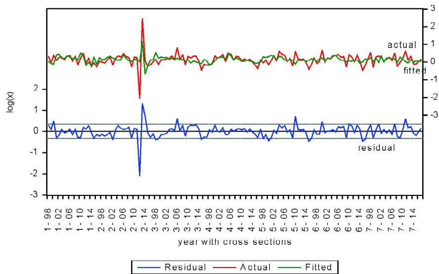
Figure 3: Equilibrium cointegrating equation 1

Two sets of five cointegrating equations were found from the VECM and the system equations where the former set of cointegrating equations were normalized from the VECM estimates and the second set of equations were found from system equations when x =India's export to African blocs which is the target variable. In EC_{1t-1} , the coefficient of \log(x_{t-1}) is obtained as -0.06381 whose t value is significant at 5% level and the other t values of the coefficients are significant in the first cointegrating equation which implies that from any log run shock the system equation tends to equilibrium or in other words, 6.38% error correction per year is the speed of adjustment by which \Delta \log x_t tends to equilibrium that is neatly shown in Figure 3. The fitted line tends to zero.